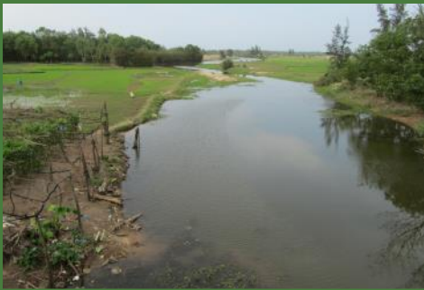
Left & Above Left: North of the Cuu Viet River where Rusty Cascio's MedEvac picked up 8 WIAs

13 Aug Thur - (Day 13) After breakfast we visit the Ho Chi Minh Mausoleum, the home of Ho Chi Minh, the Three-Tiered Pagoda and if time permits the army museum and the ethnicity museum. We return to the hotel to prepare for late evening flights that day. Anyone with a rare early morning flight, they will depart on the 15 th . (B/L)